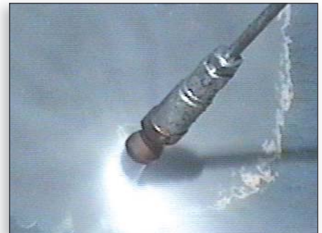
40k models feature a replaceable cartridge seal.