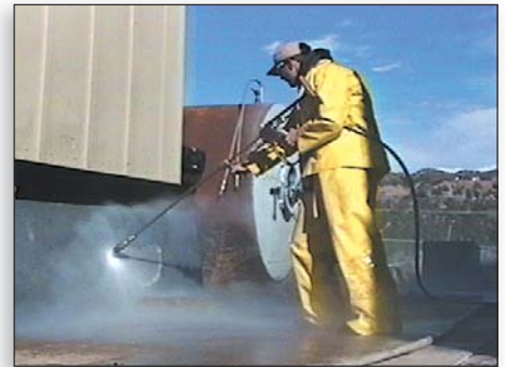
Safe and effective surface preparation.

The new system reduces down-time and improves accessibility to wear items. Now operators can have a backup cartridge on-hand which can be installed in minutes. Then the old cartridge can be field serviced and ready for re-installation when needed.