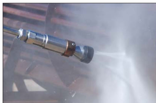
A 4-jet configuration at work on a tube bundle.