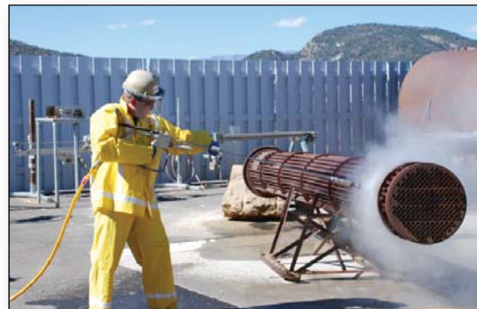
US Patent 5,909,848 and International Patents.

The BC-K and BC-K-P2 both operate from 2k-20k psi and come with a 2-jet or 4-jet head configuration respectively. As with most StoneAge® tools, they are sold with replaceable nozzle tips.