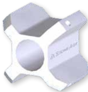
RPT 075 Centralizer