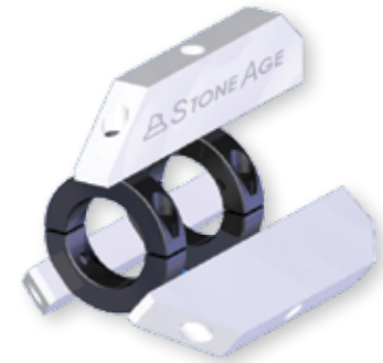
RPT 070 Centralizer

RPT 070 is available for 4", 5", 6", 8" and 12" pipes.