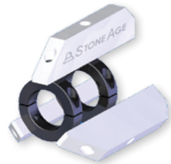
RPT 070 Centralizer

RPT 070 is available for 4", 5", 6", 8" and 12" pipes.