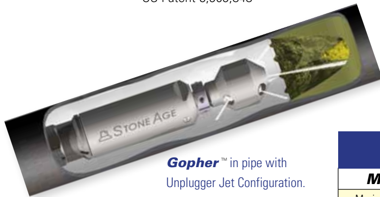
Gopher™ in pipe with Unplugging Jet Configuration.