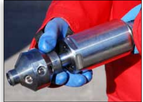
BJV-H9™ with BJ 444-S6 head.

The BJV-H9™ is our ultra high pressure 40k psi self-rotating nozzle. Like the BJV-20k™ it features a viscous fluid speed control and has accessible high pressure seals that replace easily through the inlet port.