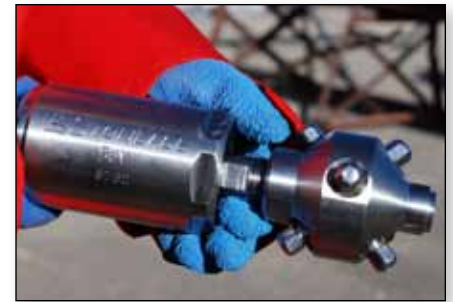
BJV-20k™ with BJ 144-P4-6 head.

The BJV-M™ is a 2-D self-rotating nozzle with a maximum working pressure of 15k psi. The BJV-M™ handles pipes and drains from 6"-72" at 15k psi, as well as tanks, reactors, process vessels, heat exchanger shells and coker cyclones. The BJV's™ use viscous fluid rotation speed control and operate using 2, 4 or 6 jets in balance. The BJV-M™ can handle flows up to 100 gpm and the BJV-P16™ can handle up to 200 gpm.