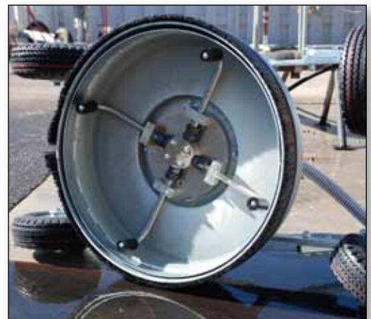
Radiused arms for quality free-spinning jets.

The optional vacuum attachment allows waste and debris to be removed through a standard 4" Camlock vacuum hose connection. A hand operated lever on the push handle closes the dump valve.