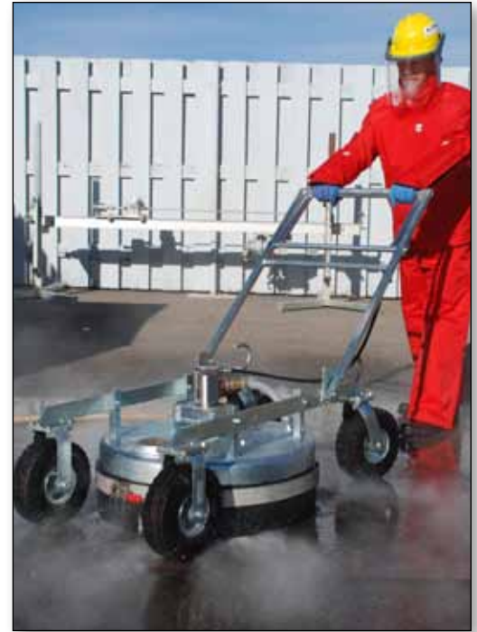
15k or 20k psi with a 24" jet path.

The FCSV™ and FCSG™ are self-rotating floor cleaners and surface preparation machines, operating at 15k or 20k psi. The differences between the two models is that the FCSV™ comes with a 4" Camlock vacuum system while the FCSG™ does not. These tools are made of corrosion resistant zinc plated steel and come with a StoneAge® SG-30™ free spinning swivel connected to four jet arms. The swivel operates at 300 - 1,000 rpm from the jet reaction and uses AP4 Attack Tips® .