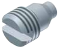
17-010 Slotted-Type M4x.5

17-006 Series is screw-type and 17-010 Series is slotted-type.