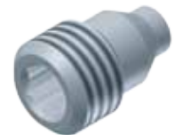
17-006 Hex-Type M4x.5

Please specify orifice size, pressure and flow when ordering.